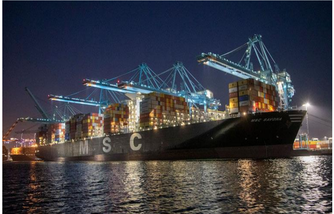
Sagar Sandesh News Service 21 st October 2022,