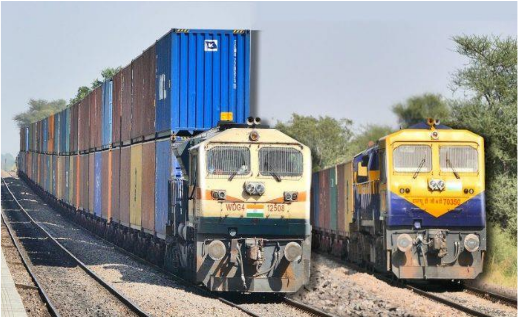
NEW DELHI Sagar Sandesh News Service December 30, 2022