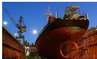
UK Home shipbuilding

The UK Government has confirmed its intention to launch a new Home Shipbuilding Credit Guarantee Scheme by the end of the year