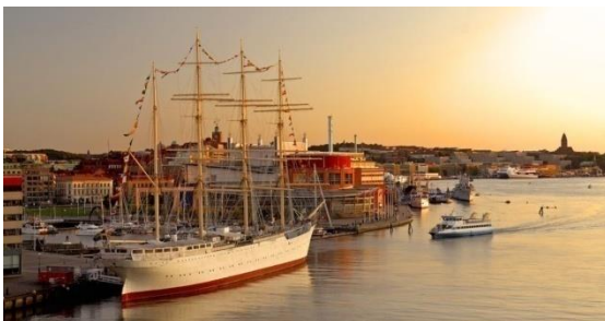
October 21, 2022

Stockholm, Copenhagen, Oslo, London, Bremerhaven, Lisbon, Malaga, Nice and Monaco. Barcelona will be its last stop during this year's expedition. In March 2023, the Gotheborg will set sail for Asia. It is scheduled to reach Shanghai in September 2023.